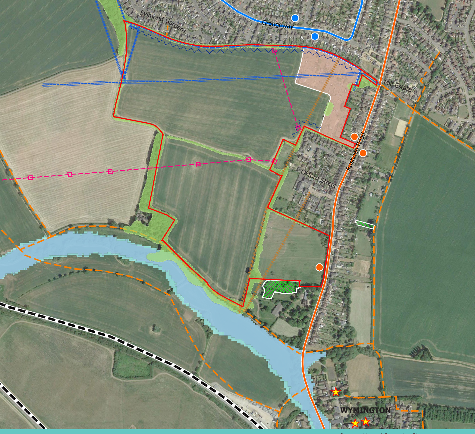
Opportunities and Constraints Plan