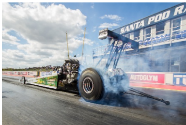
FIA European Finals 2016

Contrary to the claim that “ Drag racing events typically occur 2-3 times a year ”, which can be found in in paragraph 3.2.8 in the Wrenbridge Noise Impact Assessment Report, SPR typically hold 10 large drag racing events throughout the season. We would like to draw a distinction between proper drag racing events and other events where drag racing features, most of which produce similar levels of noise. The governing bodies that run the sport and issue rules pertaining to the sport of drag racing in the UK must issue an official race permit to allow competition to take place under the auspices of the governing body. Currently the FIA, MSA, (governing body for car classes) and or the FIM, ACU (governing body for motorcycle classes) issue race permits upon request for 29 days of competitive racing that currently take place at SPR annually. The FIA championship rounds attract more than 250 race team entries and typically run from 09:30 until 20:00. There are also six additional practice days that are associated with the race permit events, further to this we host non-competitive racing events that do not require racing permits, there are a further five of these days which takes the total number of days annually where loud drag racing takes place to 40 (Please see appendix C). There may also be a number of “track hire” days for private testing purposes. All of these days involve cars and motorcycles running under power with racing style open exhausts.