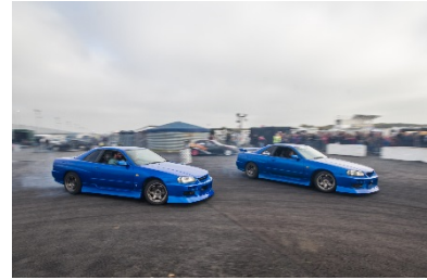
Images from Drift What Ya Brung