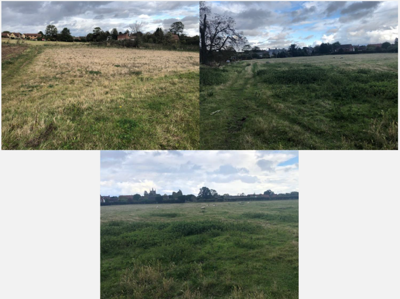
Figure 2-2 - Photomontage of views across the site