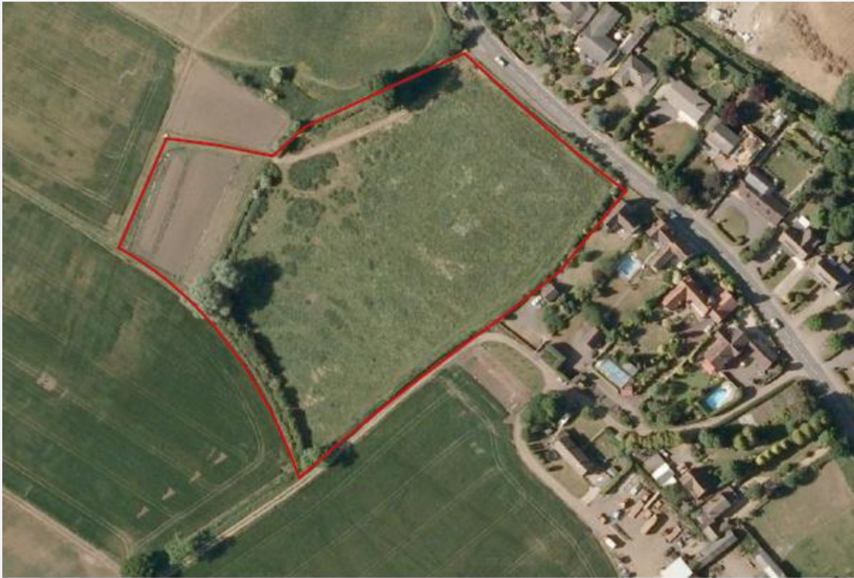
Figure 2-1 - Site Plan