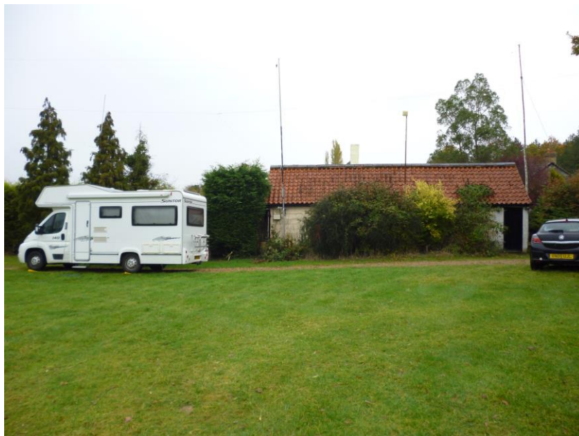
Existing field looking towards the radio club building