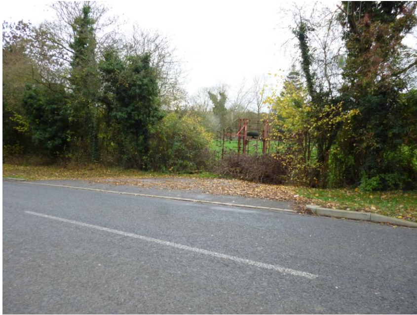
Existing access to the site - November 2018