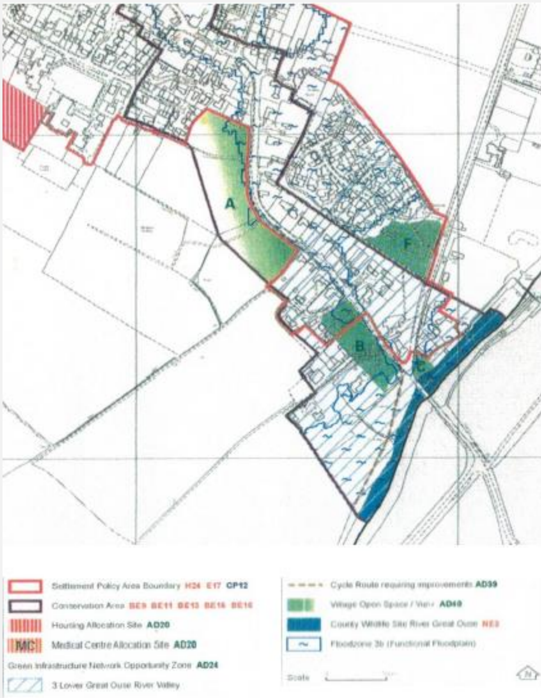
Figure 2-3 - Map extract highlighting designations and allocations, based upon Beford Borough Council's proposals map

2.1.7. The site is not subject to any environmental designations, such as Green Belt, Special Areas of Conservation or Sites of Special Scientific Interest. The site is located largely in Flood Zone 1, which is the flood zone most suited to development. Despite this, the site is bound by Flood Zone 2 to the north and a small section of the north-west corner of the site (circa 150sqm) is located in Flood Zone 2.